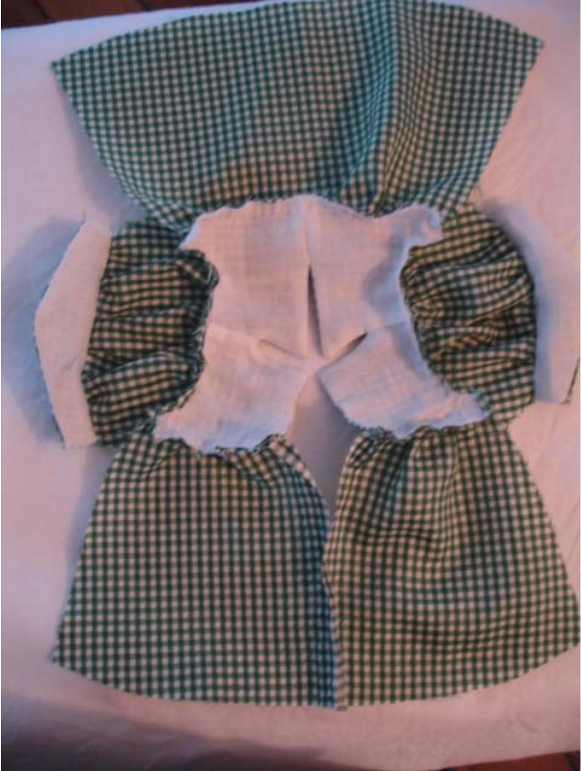
Wrong side of dress before sewing side seams, showing lining fabric of lapels and cuffs, center back opening, and cuff shape.