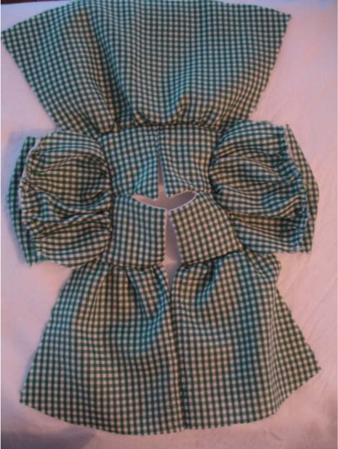
Right side of dress before sewing side seams, showing the finished edges of the neckline and lapels, and the cuff application.