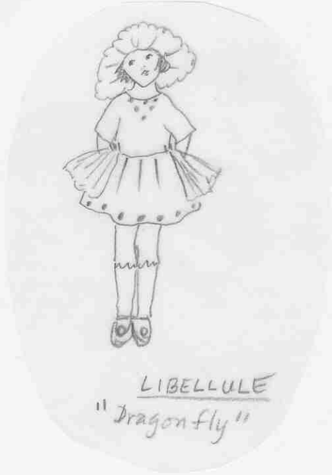
LIBELLULE "Dragon fly"