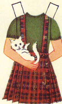
Her plaid kilt and crew-neck sweater are nice for school