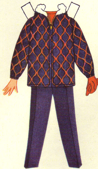
Her snow pants and Orlon-pile-lined jacket are cozy as can be