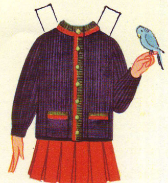
Her skirt and bulky cardigan are warm. And washable, too!

COPYRIGHT © 1962 BY McCALL CORPORATION BETSY'S SKIRTS AND SWEATERS BY PANDORA KNITWEAR, INC., AND HER SNOW OUTFIT FROM MACWIL, INC., MAY BE SEEN AT STORES LISTED ON PAGE 244