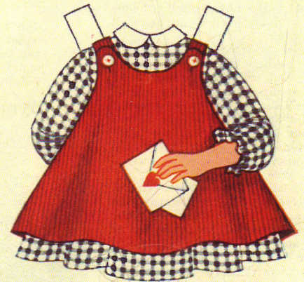
My mother made this jumper dress. It's in two parts, and I wear each by itself. McCall's pattern 5982

Well, I had my first ice-skating lesson. At first, down I went; but I didn't care, because I wasn't the only one who fell. Then the instructor came, and he crossed hands with me. Suddenly, there I was, skating! I felt like a bird. After skating around and around with me, he said, "Now try it by yourself. Just THINK you'll be able to do it, and you CAN." So I skated three steps, thinking, I CAN! I CAN! Then woosh , down I went! I couldn't! But I kept trying, and I was terribly wobbly, all by myself, but I wasn't scared. And by the end of the morning, guess what! I found I could! I wasn't the best skater on the ice, but I didn't fall, and I didn't cling to anyone. I skated till my toes froze! Skating is the MOST fun, I think. Don't you?