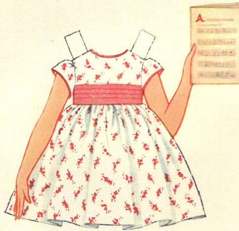
She wore this flowered Dacron taffeta to a children's concert