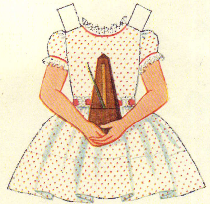
Her dotted-swiss dress has lace around the neckline and sleeves