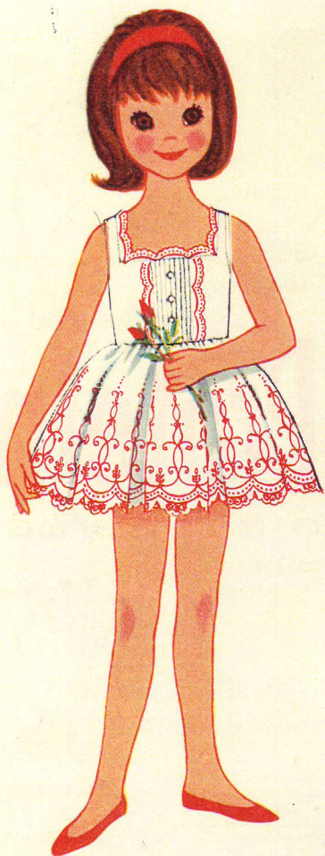
Betsy's embroidered slip is almost too pretty to cover