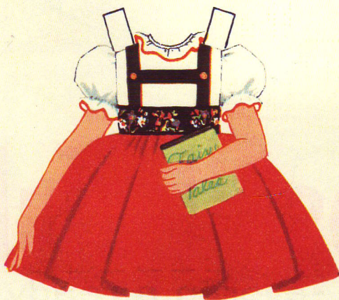
She feels like a fairy-tale character in her red cotton