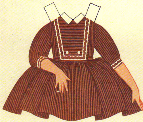
Betsy's pretty striped cotton is nice for now and for fall