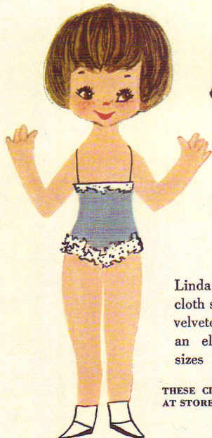
This is Linda McCall

Linda is wearing a broadcloth shirt and a washable velveteen jumper-all with an elasticized waist. In sizes 1 to 3, about $9