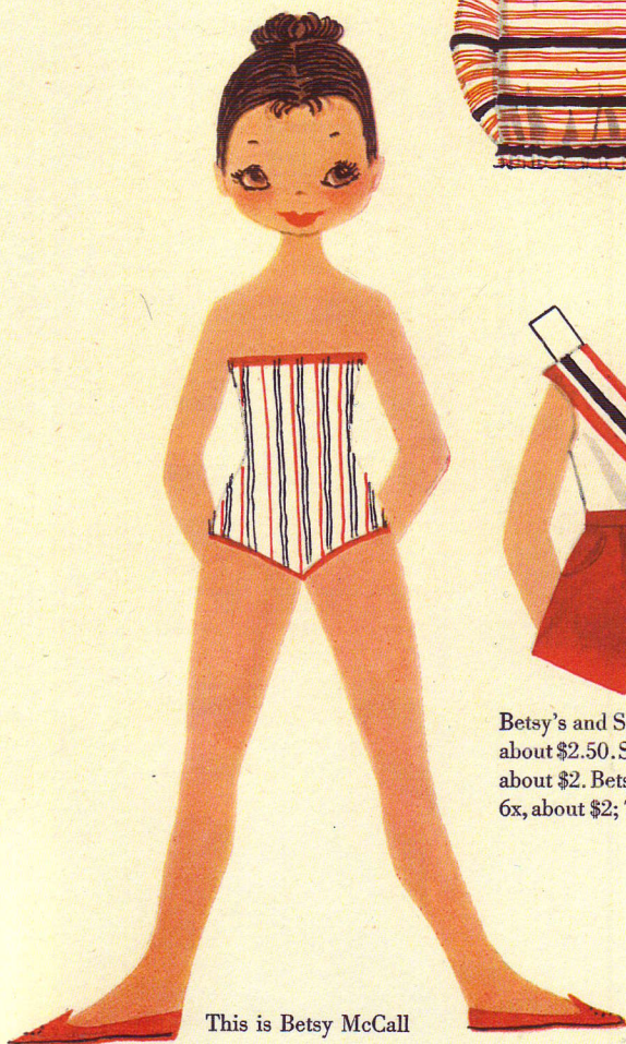
This is Betsy McCall

Betsy and Sandy have look-alike cardigans. Sizes 3 to 6x, about $2; 7 to 14 (girls only), about $3