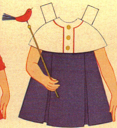
The white top on this blue dress looks like a real cape!