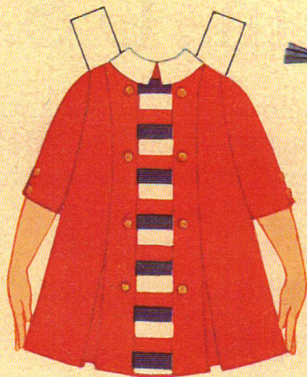
Red, white, and blue, and brass buttons, too. Pretty?

them, if we have friends from other countries. Or our mothers can make them. Mommy is making one for me. It's to be a surprise, so I don't know what it will be. Maybe I'll be a little Dutch girl in a pointy cap. Maybe I'll be a Swiss girl, like Heidi. Or a Japanese girl in a kimono. Or a Turkish girl in pantaloons. Or a Hawaiian in a muumuu. Or a Spanish girl with a lace shawl on my head. I do think surprises are fun—I mean, all but the waiting part. I can't BEAR to wait. Anyway, I know the money will be American, a dime admission from our parents and friends, for the UN Children's Fund, of course, for food and medicine.