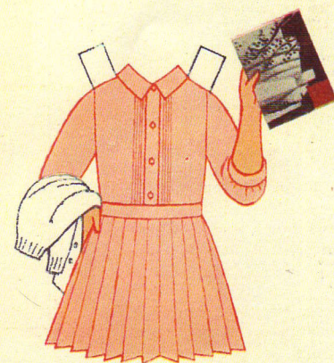
She feels so important in this shirt with tucked front, tightly cuffed sleeves, and town collar

COPYRIGHT © 1963 McCALL CORPORATION BETSY'S SHIP 'N SHORE BLOUSES (SIZES 3 TO 6X; ABOUT $2.50 TO $3) MAY BE SEEN AT MACY'S, NEW YORK, KANSAS CITY; LASALLE'S, TOLEDO; DAVISON'S, ATLANTA; LOVEMAN'S, BIRMINGHAM