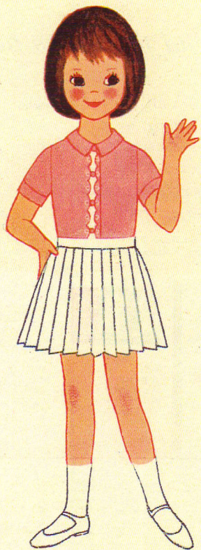
This blouse is trimmed with a design appliquéd to a strip of white piqué all down the front