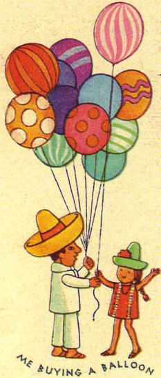
ME BUYING A BALLOON