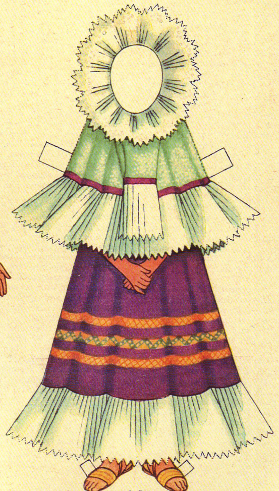
TEHUANTEPEC FIESTA DRESS