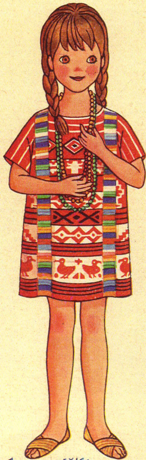
ME IN A MEXICAN HUIPIL