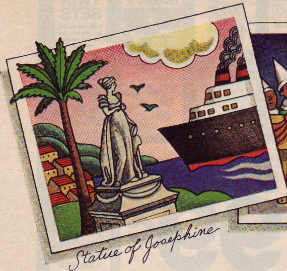
Statue of Josephine