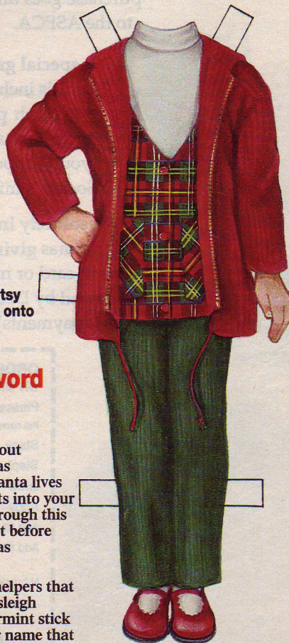
Comfortable clothes make a long drive easier.